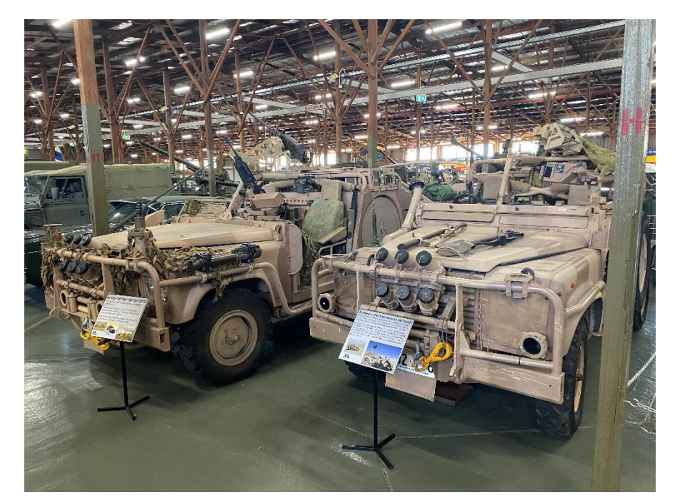
Friday headed over to Bandiana Museum which never disappoints!