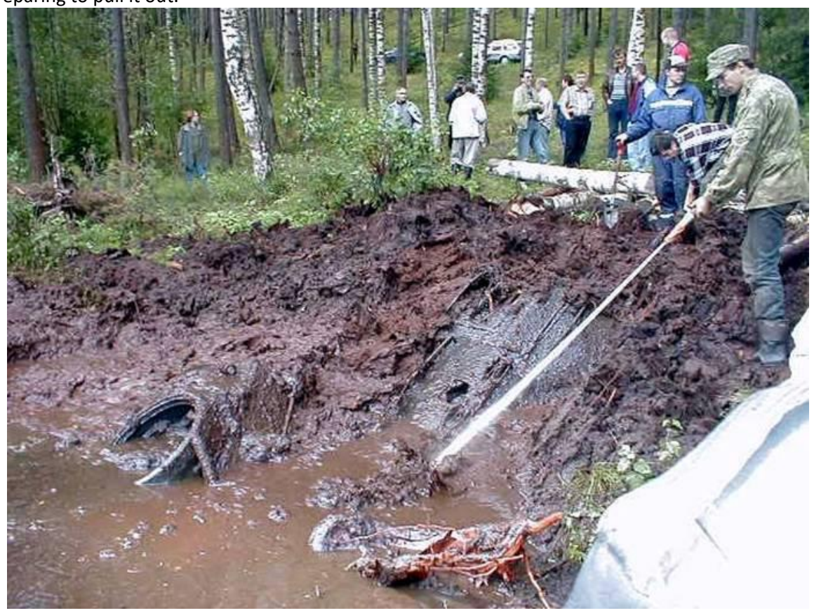
People from the nearby village come to look how it would be done.