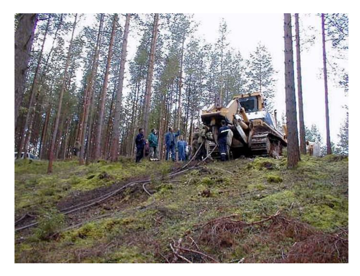
Here it comes..