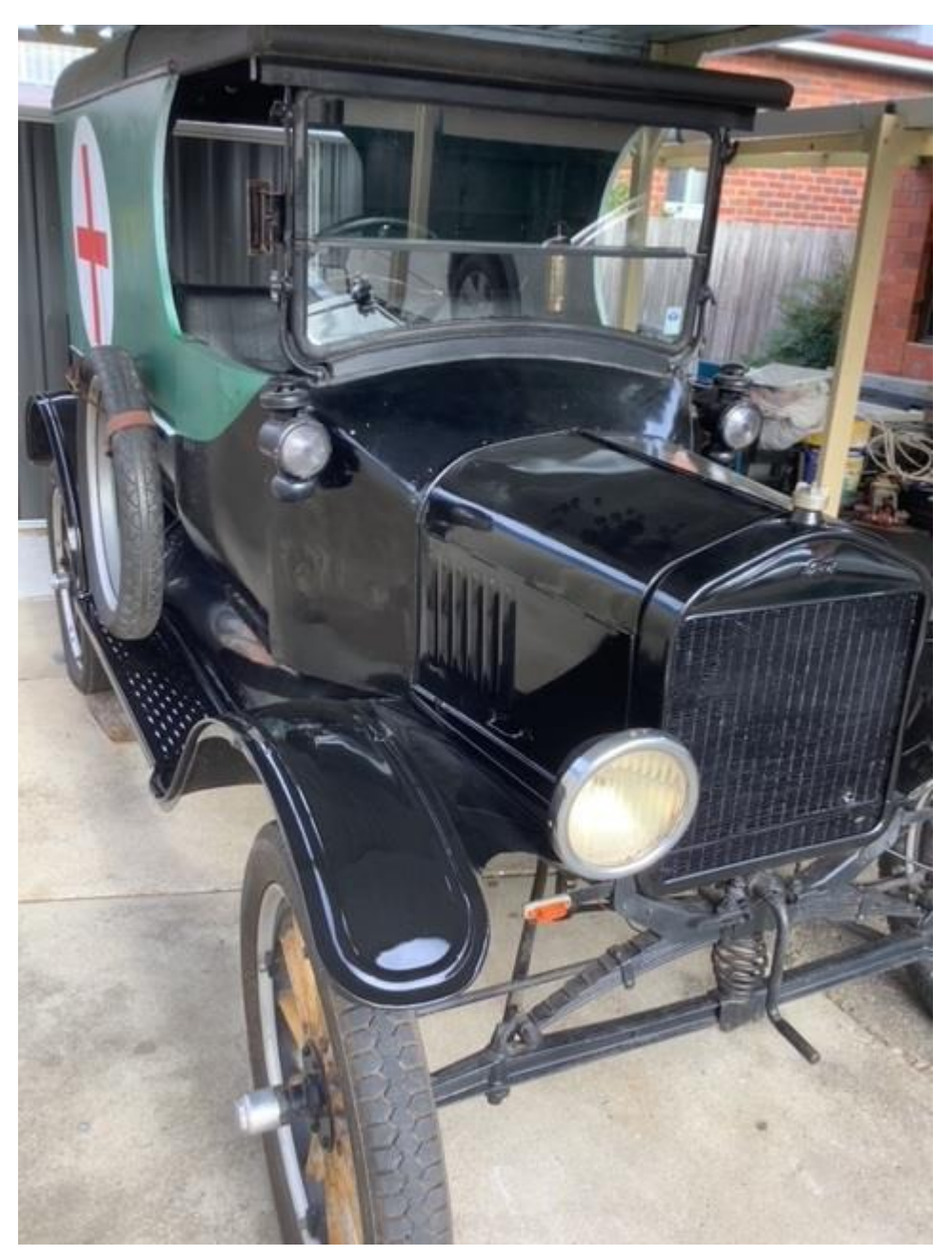
This is how it currently looks in civilian ambulance trim:

I'll be setting it up as a military ambulance.