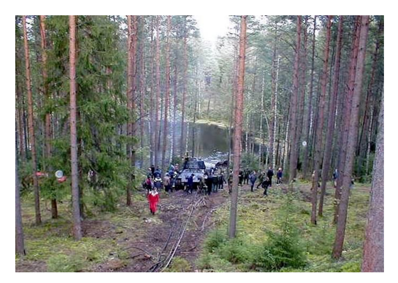
As far it has been known, after a small repair and service they were able to start its diesel engine.