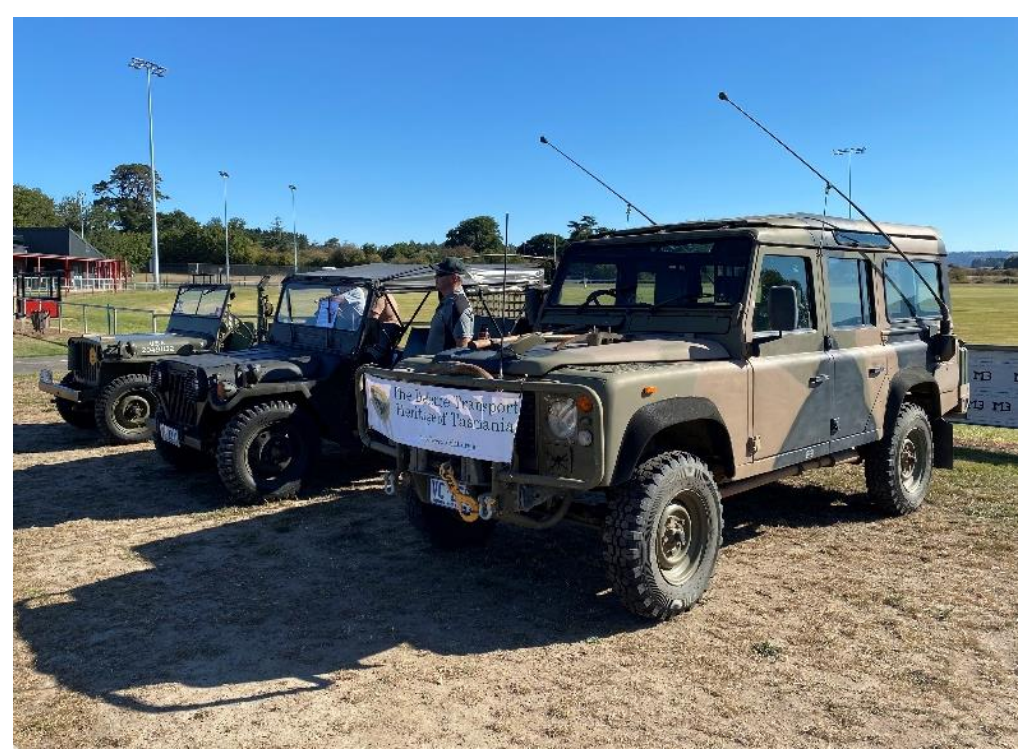
Thanks to Terese Binns from the Northen Tasmanian Light Horse Troop for inviting us to attend.