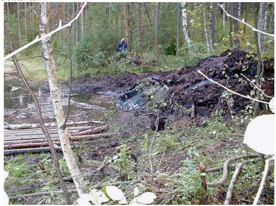
Through muddy shore of the lake